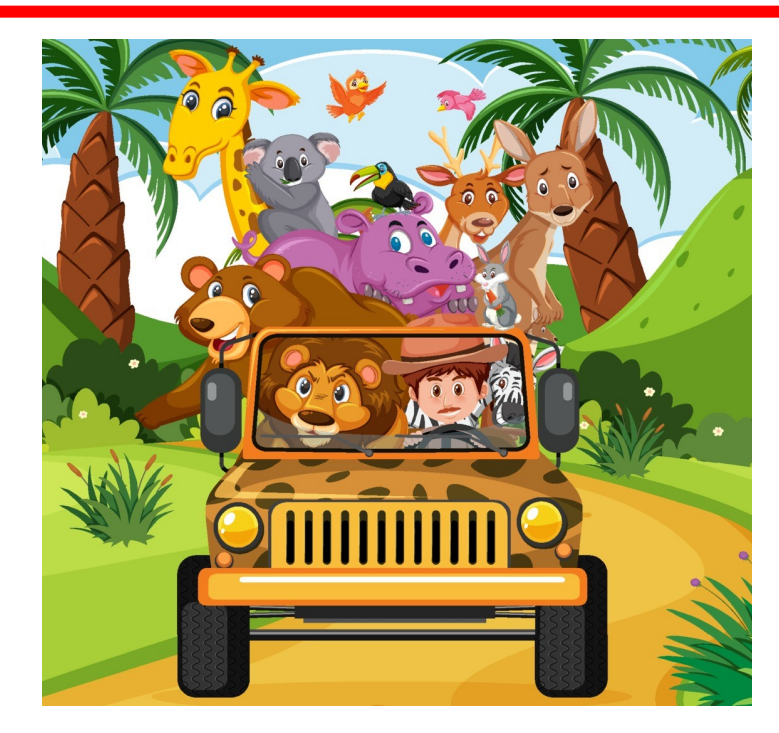
Jungle Adventures—Autumn One