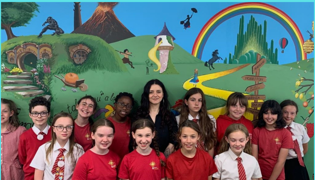
Our fabulous library mural