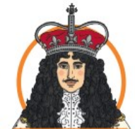
King Charles II