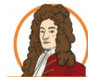
Sir Christopher Wren