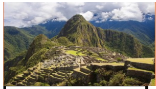
Machu Picchu, Peru