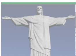
Christ the Redeemer, Brazil