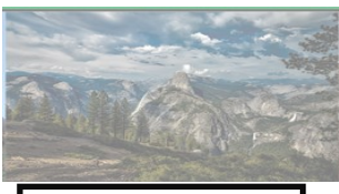
Yosemite Valley, California