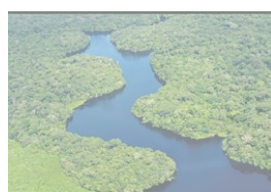
Amazon River, Brazil