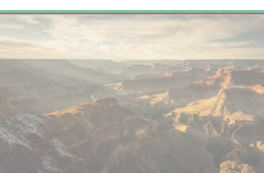
Grand Canyon, Arizona