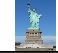
The Statue of Liberty, New York