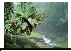
Amazon rainforest, Brazil