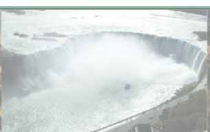
Niagara Falls, Ontario/New York