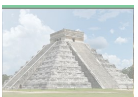
Chechen Itza, Mexico