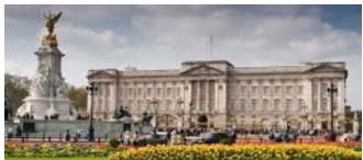
Buckingham Palace- a human feature in England.