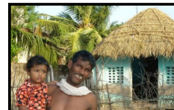
Chembakolli is in the south of India.