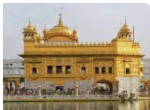
The Golden Temple - a human feature in India